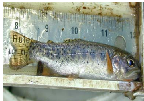
Cutthroat trout (up to 39" long)