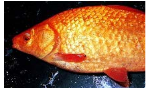
Goldfish (up to 24" long)