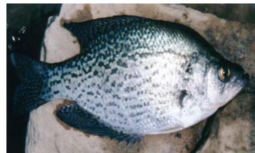
White crappie (up to 21" long)