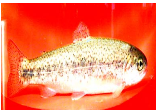
Steelhead (up to 47" long)