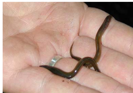
Pacific lamprey (up to 30" long)