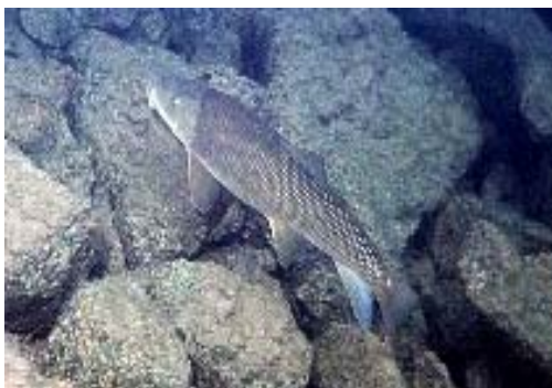
Largescale sucker (up to 24" long)