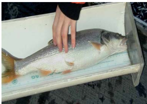
Northern pikeminnow (up to 25" long)