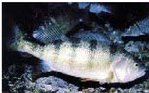
Yellow perch (up to 20" long)

Photo credits: City of Portland Endangered Species Program, Michael Gjernes, Ernest Keeley, Massimo Lorenzoni, Bob McDowall, Oregon Department of Fish and Wildlife, Thorke Østergaard, Robert Rice, Juan Antonio Delgado Saez, Geoff Steinhart, and Steffen Zienert.