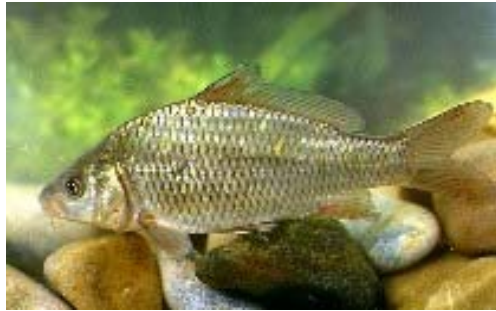
Common carp (up to 48" long)