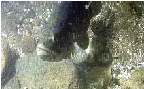
Smallmouth bass (up to 27" long)