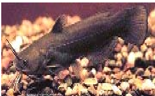
Yellow bullhead (up to 19" long)