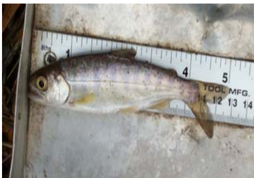
Chinook salmon (up to 59" long)