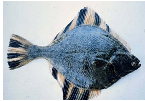
Starry flounder (up to 36" long)