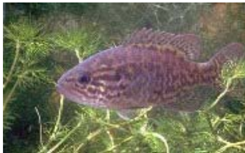
Warmouth (up to 12" long)