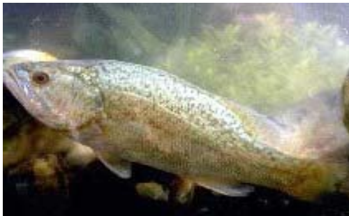
Largemouth bass (up to 38" long)