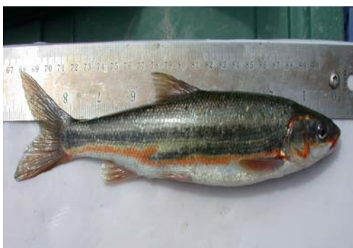
Peamouth (up to 14" long)