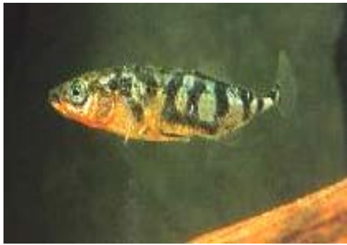
Three-spined stickleback (up to 4" long)