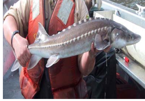
White sturgeon (up to 240" long)

Acknowledgements: This project was funded with a grant from Oregon Parks Foundation and support from City of Portland Bureau of Environmental Services.