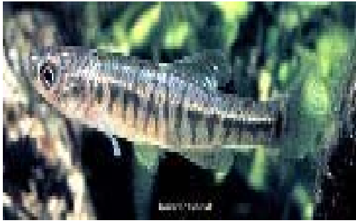
Banded killifish (up to 4" long)