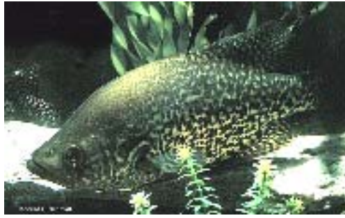
Black crappie (up to 20" long)