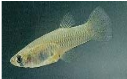
Mosquitofish (up to 2" long)