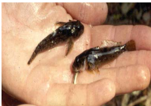
Prickly sculpin (up to 12" long)