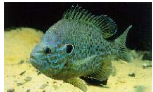
Pumpkinseed sunfish (up to 16" long)