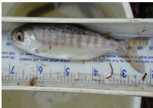
Coho salmon (up to 43" long)