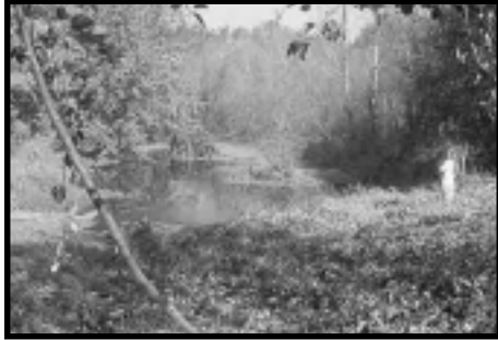
Forested wetland area on the recently acquired Springs property

The City of Portland acquired a 21-acre parcel in the Upper Slough watershed for protection and restoration. This unique parcel includes several freshwater springs coming out of the hillside, a large pool and a forested wetland.