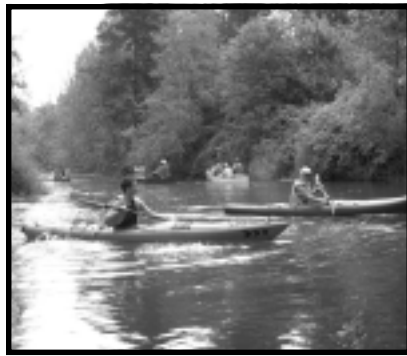
Kayakers enjoy the Upper Slough at this year's Regatta.

9th Columbia Slough Small Craft Regatta Sunday, July 27th 9:00 am - 1:00 pm Bring your family and your boat to the largest paddling event in Oregon. Location TBA Contact: The Columbia Slough Watershed Council at 503- 281-1132 or info@columbiaslough.org