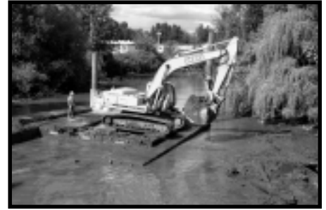
Heavy machinery constructing wetland benches in Middle Slough

The wetland bench portion of the 1135 Project will result in the creation of emergent wetland habitat or "benches". Soil from the slough channel is being 'stacked' to create in-channel wetlands. The dredging also creates a deeper meandering channel and improved water flow. Thus far MCDD and the Corps' contractor have completed 2 miles of the 7.5 mile project - from the Drainage District office to the mouth of Whitaker Slough and from the NE 143rd levee to NE 158th. The constructed wetland benches and islands have been seeded, and additional plantings will occur this winter. Dredging work has been completed for the season.