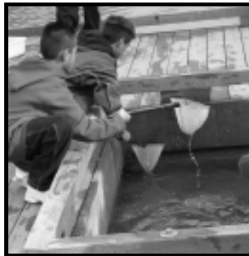
Local students collecting macro-invertebrates from Whitaker Ponds dock.