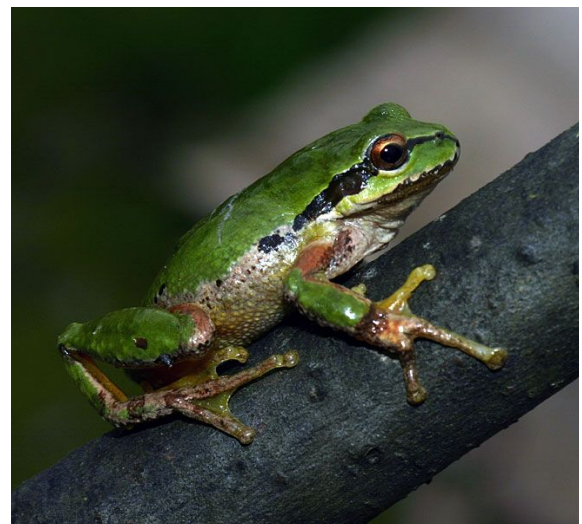
Pacific Chorus Frog