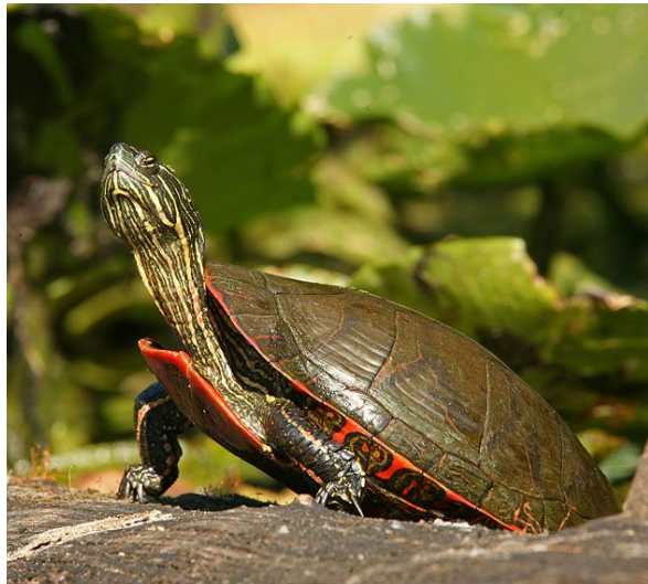
Western Painted Turtle