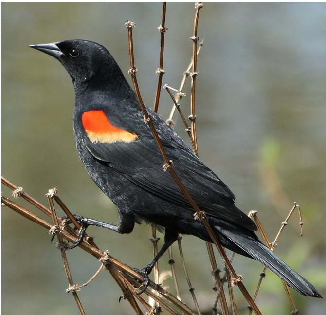
Red Winged Blackbird